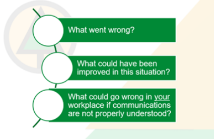
Figure 1: Discussion topics from course

While there are some differences in these methods that will be explored in the class, it is always important to formulate a message and deliver it