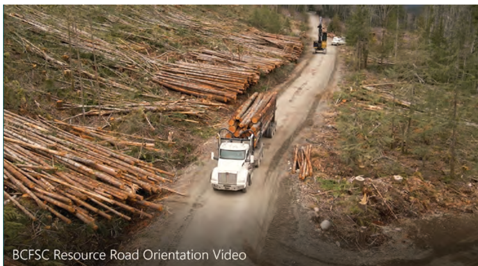
BCFSC Resource Road Orientation Video

The video was produced by the BC Forest Safety Council (BCFSC) in partnership with Mosaic Forest Management, Coastal GasLink, the BC Ministry of Forests, Lands, Natural Resource Operations and Rural Development, West Fraser Timber, Interfor, Conifex, Sinclair Group, Weyerhaeuser, Gorman Bros, Canfor, Tolko, and professional off-road driver training company, Overlanding Training Canada, as a collective message to the public to ensure resource road users understand and follow resource road safety rules.