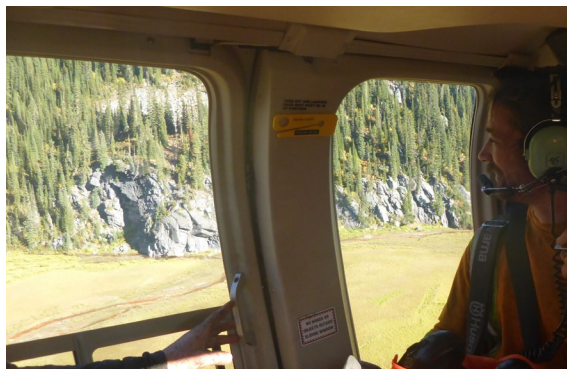
The best part of the job