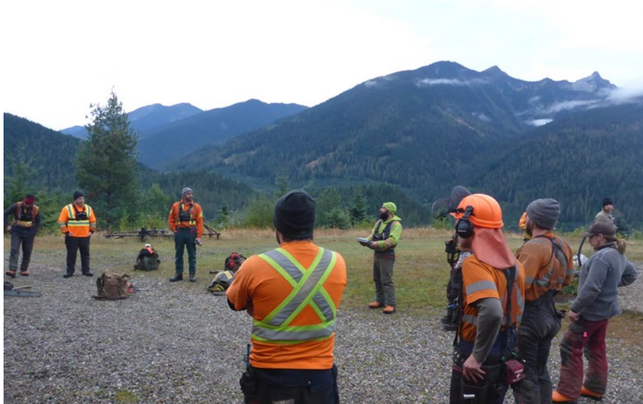
Daily crew safety discussion