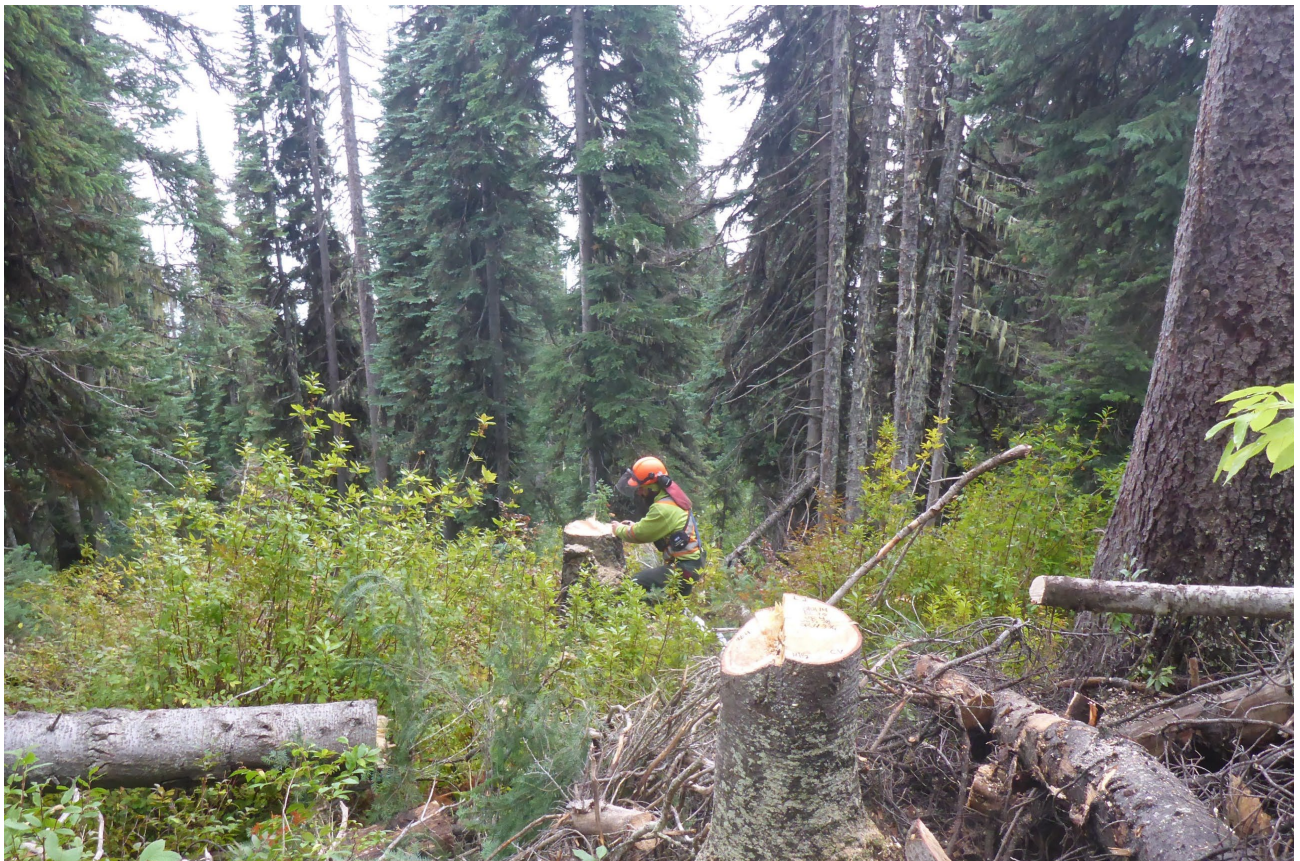
Falling Supervisor performing stump audit