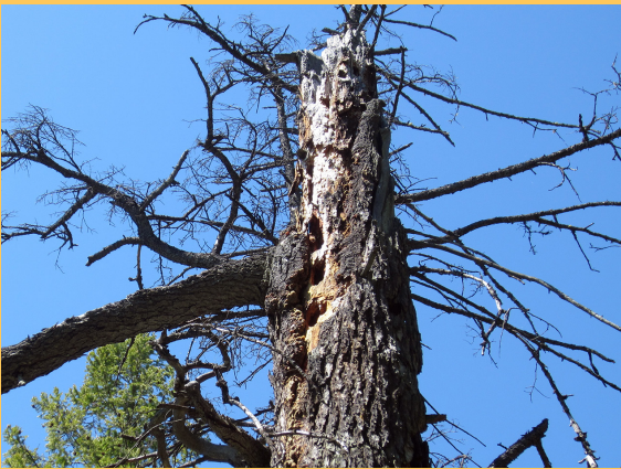
Large Dead Limb

✓ PROTECT WILDLIFE HABITAT ✓ MAINTAIN WORKER SAFETY