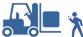
Mobile Equipment/ Pedestrian Interface