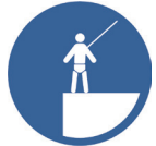
FALL FROM ELEVATION