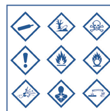
HAZARDOUS/ BULK MATERIALS