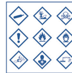
HAZARDOUS/ BULK MATERIALS